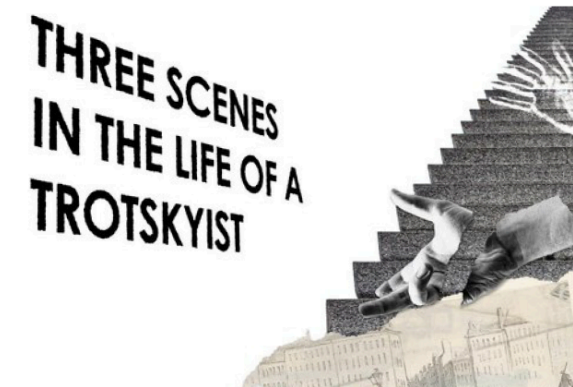
Three Scenes in the Life of a Trotskyist , a new play by Andy Boyd '18 , is offering discounted tickets to Columbia alumni for the February 25 performance. Use the code COLUMBIA for $15 tickets.