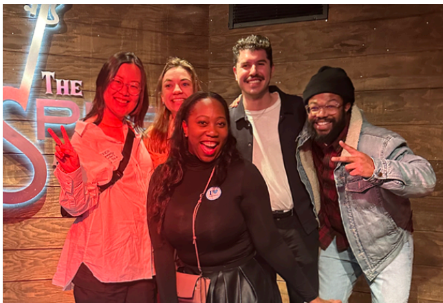
Sundance Film Festival 2024