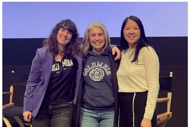
CUE Event on Crafting Story with Acclaimed Writer/Directors